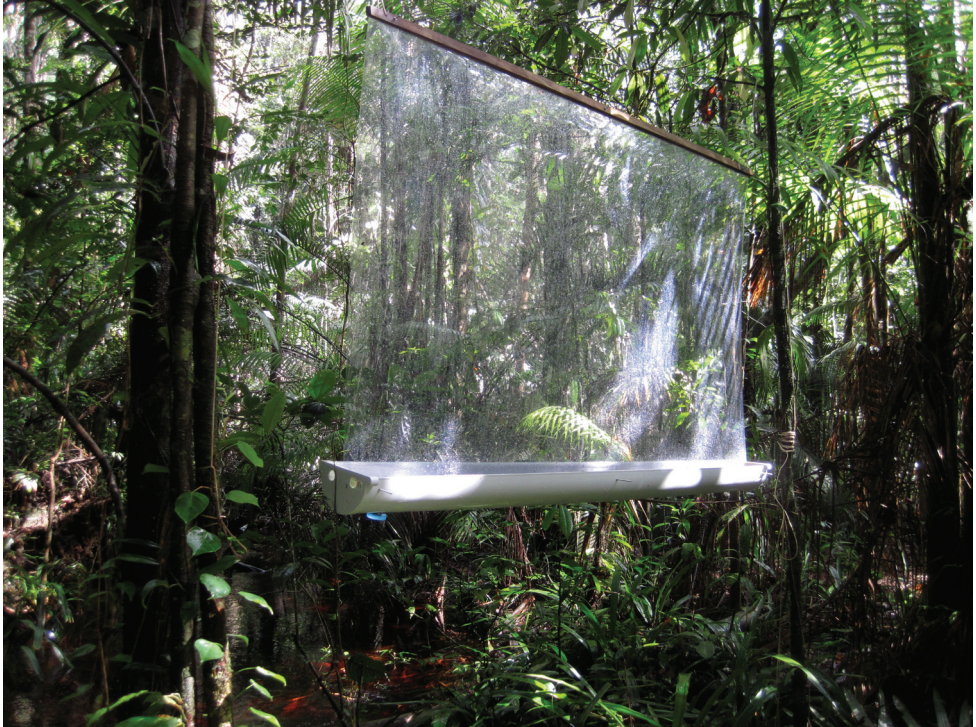
Figure 2. Picture of the modified windowpane trap described in this study (Lamarre G).