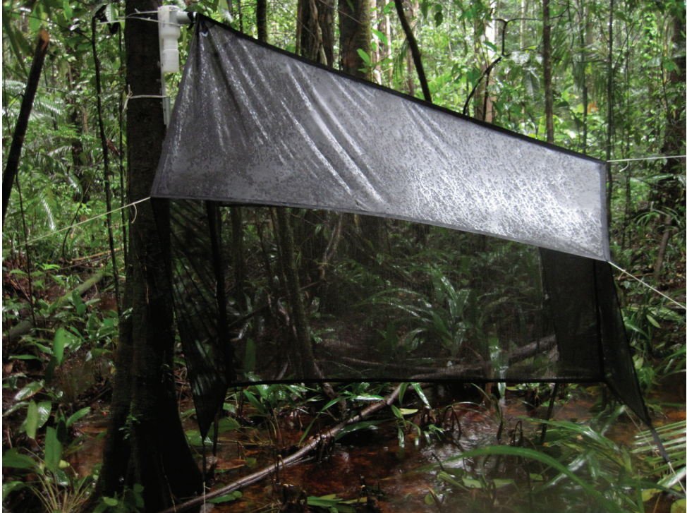
Figure 1. Picture of a malaise trap installed in a flooded forest of French Guiana.

lightweight plexiglass, our WT model is also easy to transport and to install. This type of insect trap can be built with low-cost materials. For example, in French Guiana (the most expensive country in the region), we estimate the cost per trap as 90 euros, whereas in Peru the materials to make the trap cost only 40 euros (prices verified in 2011 by the first author).